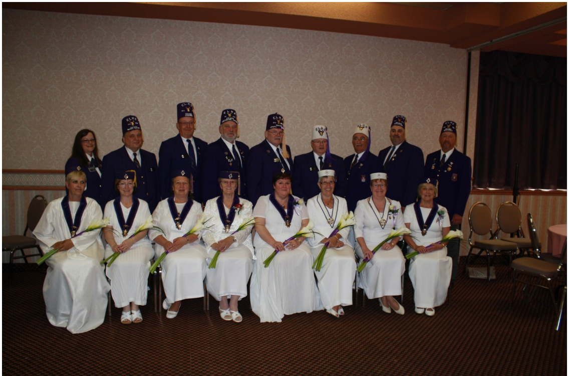
SUPREME & GRAND LODGE EXECUTIVES 2011-2012